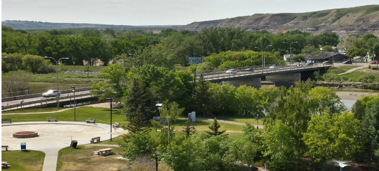
Figure 2. Gordon E. Taylor Bridge, looking North West over the Red Deer River

A traffic accommodation strategy is in place to mitigate the impacts to travelers. This includes additional signage, delineation, and if required, illumination. Please watch for all and obey all construction zone signage. For up to date information on this project, please call 5-1-1 toll free or visit 511.alberta.ca